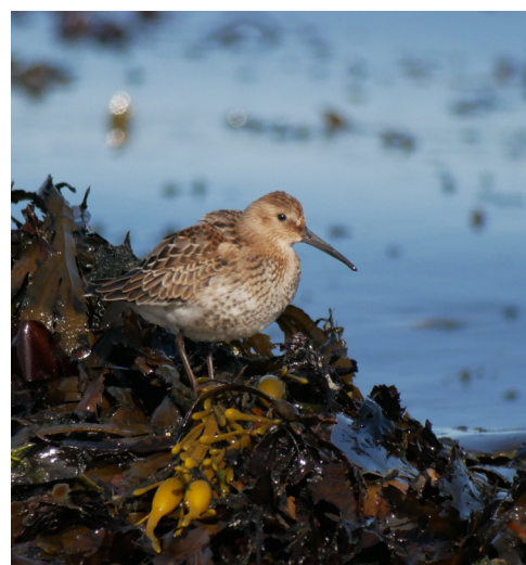
Dunlin feeding on seaweed

CSE are looking for parish councils and other groups to get involved in testing the tool and then to use it for its intended purpose. This information was circulated to the Climate Change Group and a member has volunteered to help with testing and developing the tool once it is available. The demonstration of the tool will take place on Tuesday 12 January 2021.