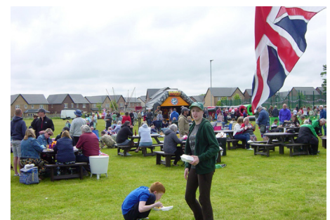
People at the Jubilee event enjoying the picnic.