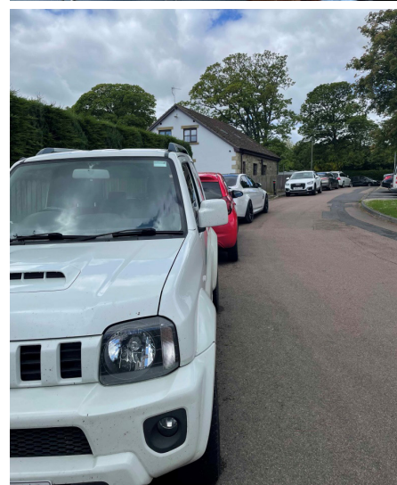
Above: Parked cars causing congestion at the junction with North End