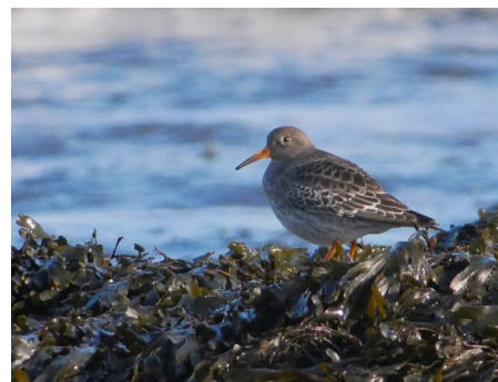
Above: Northumberland's population of purple sandpipers is internationally important

Following the rejection of a housing planning application for the Pondfield at Longhoughton, the Steering Group approved a proposal to classify the Pondfield as a Local Green Space. This status will preserve the Pondfield from further development provided the Neighbourhood Plan is approved. The Neighbourhood Plan containing all these proposals and much more will be ready for consultation with the community in the spring of this year. The Parish Council want a full consultation in which all residents can get involved and express their views.