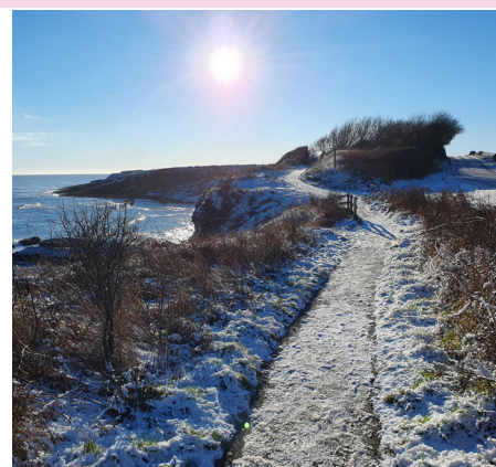
The Coast Path at Howick in January