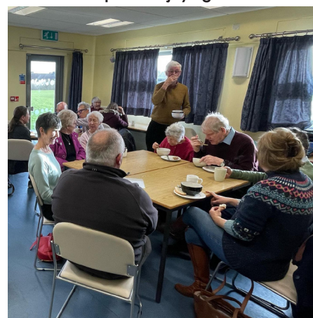
Below: Participants enjoying lunch